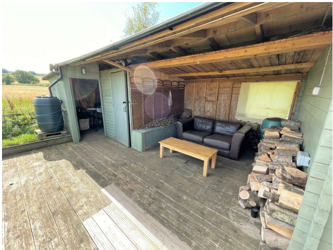
Useful wood store with adjacent Humus composting toilet.